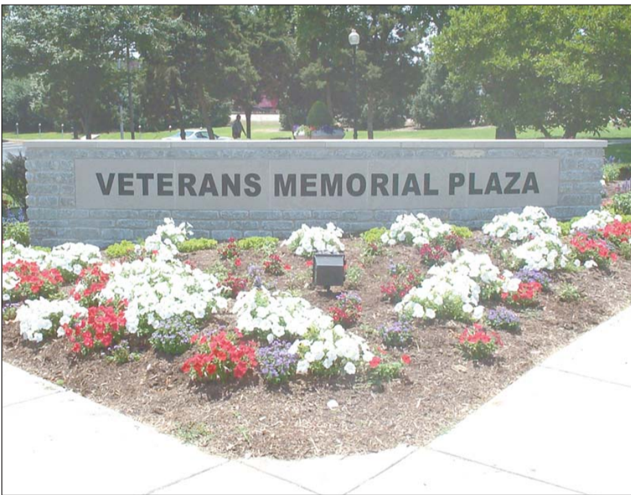
The Veterans Memorial Plaza Wall

The VFW Post 2605 worked with Carbondale Main Street to develop the wall that designates the Veterans Memorial Plaza located on the southeast quadrant of the Town Square. Funding for the wall was provided by donations through the VFW Post 2605 and Carbondale Main Street.