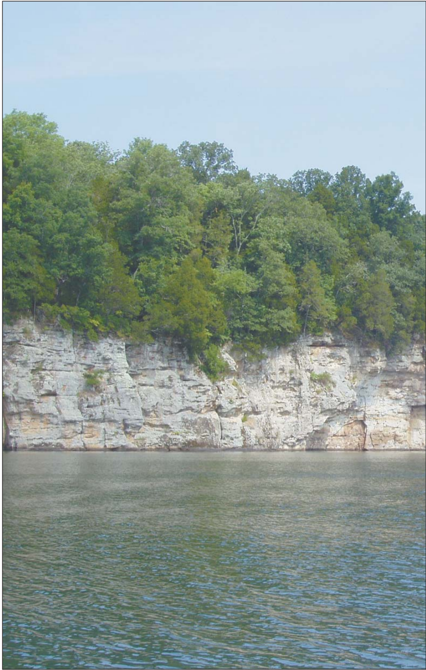
Picturesque Cedar Lake