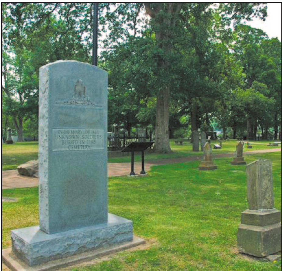
Woodlawn Cemetery in Carbondale is the site of the first Memorial Day Service in Illinois and is the location of the Annual Memorial Day Service in Carbondale. Pictured is the monument placed in memory of all unknown soldiers buried in Woodlawn Cemetery.