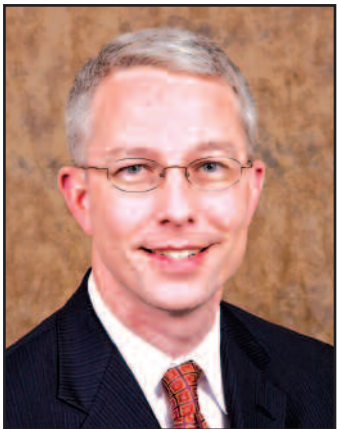
Mayor Brad Cole

undertaken a number of cost-saving efforts meant to reduce our expenditures and offset anticipated reductions in income (primarily from sales tax). With increased pension obligations and unfunded mandates from the state, we have made staffing reductions and modified programs to better suit our ways and means.