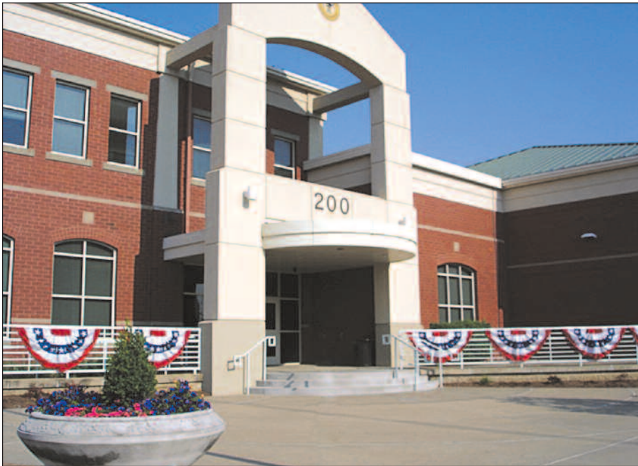
Flags adorned the City Hall/Civic Center facade in observance of the Independence Day holiday.