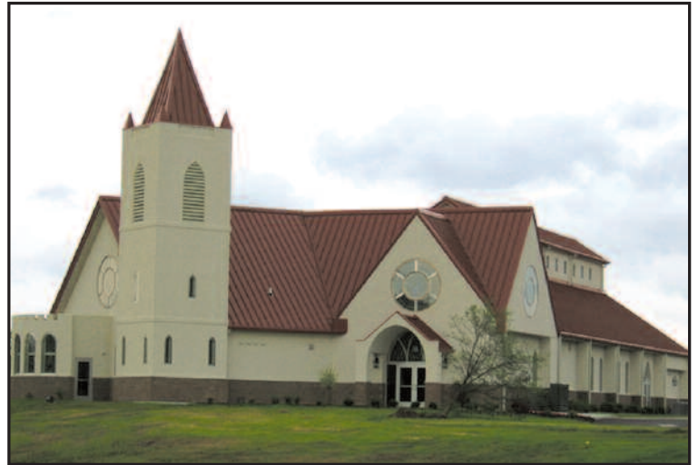
The View First Baptist Church located at 1201 N. Giant City Road was recognized in the category of compatible new construction.