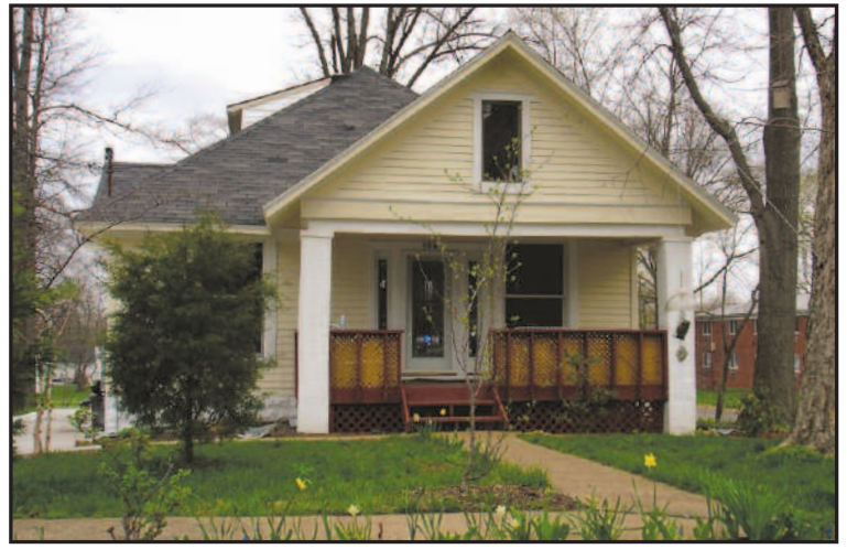
The Train Inn Bed and Breakfast located at 406 E. Stoker Street was recognized in the category of restoration.

For more information on the Historic Preservation Commission activities, please contact the Carbondale Planning Services Division at 457-3248.